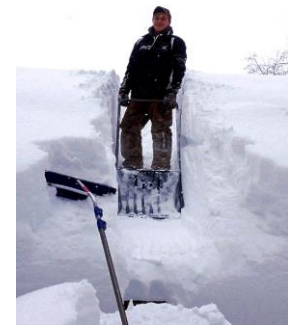
Roof clearing, Severn River, this January!

FOCA's Terry Rees took to the water's edge for a short reminder blog about winter water safety; click the video at left.