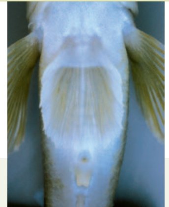
Fused pelvic fins act as a suction cup for the round goby.