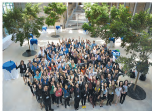
FOCA spoke at the WatIF (Water Initiative for the Future) Conference, Kingston