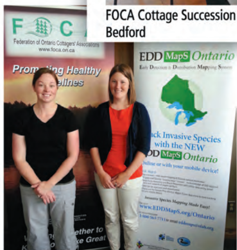
FOCA spoke at International Association for Great Lakes Research, Hamilton