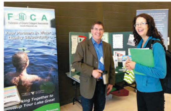
FOCA at Muskoka Summit on the Environment, Bracebridge