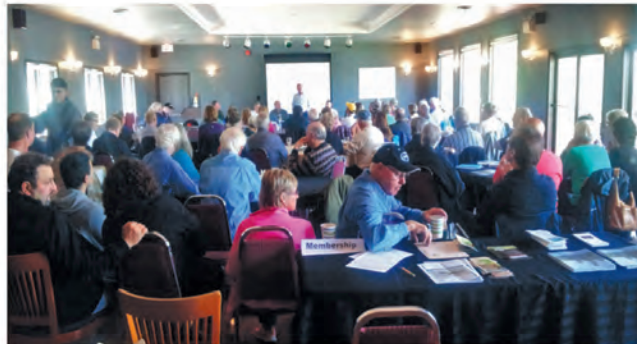
FOCA spoke at Otter Lake Association AGM, Parry Sound