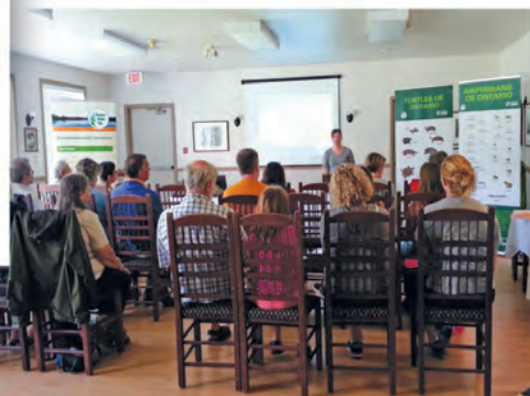
FOCA spoke at Healthy Shorelines Workshop, Stoney Lake

● Approximate locations of FOCA's member Associations!