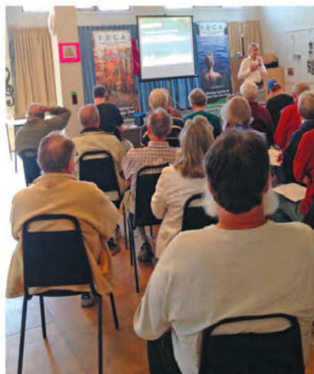
FOCA Cottage Succession Seminar in Bedford