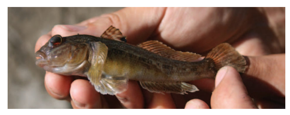
Small, bottom-dwelling round goby.

To prevent the spread of this invasive species, the Ontario government has banned the possession of live round goby and the use of round goby as a baitfish.