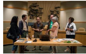
More engaged citizens, after the invasive species workshop