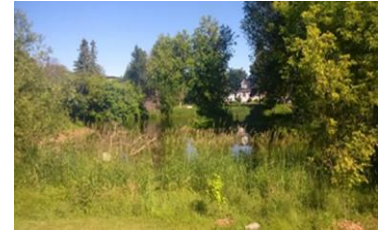
Example of past funded project to create fish habitat

Fisheries and Oceans Canada has announced the latest round of funding for their Recreational Fisheries Conservation Partnerships Program (RFCPP). The RFCPP supports conservation organizations through partnership projects aimed at restoring recreational fisheries habitat in Canada. The program can fund habitat restoration projects such as riparian planting, the stabilization/enhancement of habitat, etc. One-year (2016-17), two-year (2016-18) and three-year (2016-19) project proposals will be accepted up until April 22, 2016 .