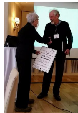
The last Award was presented to Jack's Lake Association in March 2016

https://foca.on.ca/member-services/foca-achievement-award/