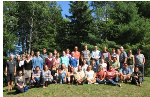
FOCA and partners at Science Day

On August 18, FOCA participated in an Inland Lakes & Northern Science Unit Science Day with our partners at the Dorset Environmental Science Centre (DESC). Presentations were made on inland lake research including the Lake Partner Program (LPP), understanding multiple stressors on lakes, Zooplankton eDNA research, long-term lake recovery studies, and more.