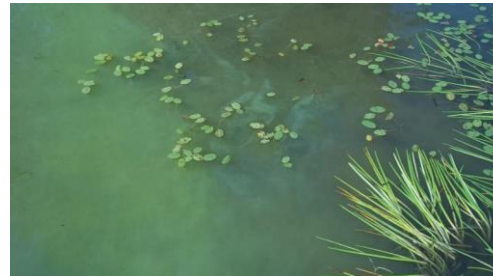
Blue-green algae

Meanwhile, blue-green algae bloom reports on inland waters continue to emerge, including on Muskrat Lake in Renfrew County. There is a suspected bloom on Three Mile Lake in Muskoka. ( Download the Public Notice ; PDF, 1 page)