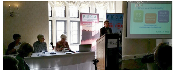
Rural Mayors at FOCA's event panel , Nov.2016, spoke to 100 lake association representatives at the FOCA Fall Seminar for Associations

Please let FOCA know what YOUR MUNICIPALITY is doing to communicate effectively with seasonal residents and the waterfront community in your area.