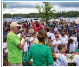
Supporting Volunteer Lake Associations