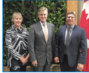
Effective Government Relations