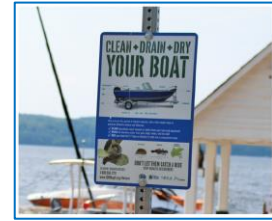
Advancing Science into Action!