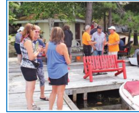
Bridging Gaps in Rural Communities