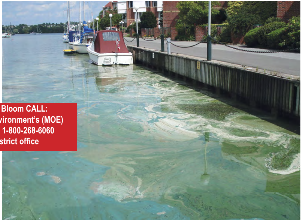
Blue-green algal bloom.

Algae are an important part of lake "food Continued on page 20