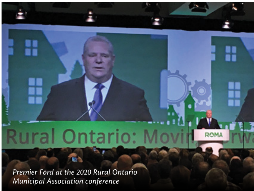
Premier Ford at the 2020 Rural Ontario Municipal Association conference