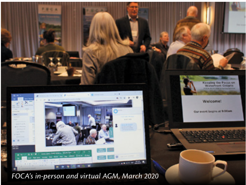
FOCA's in-person and virtual AGM, March 2020