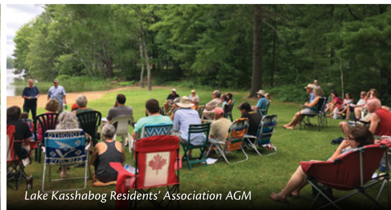
Lake Kashtabog Residents' Association AGM